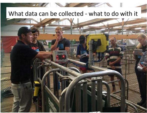
What data can be collected - what to do with it