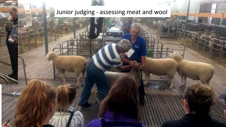
Junior judging - assessing meat and wool