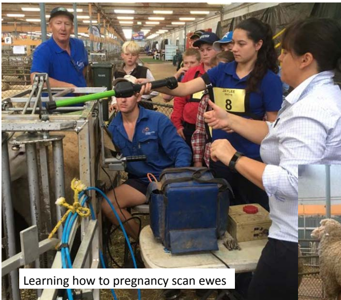
Learning how to pregnancy scan ewes