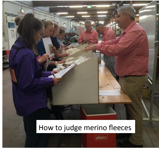
How to judge merino fleeces