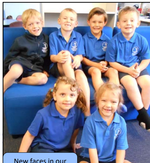
New faces in our P-2 classroom

education. Last year we were the third ranked public school in the whole state of Victoria for the % of excellent Year 12 study scores, the only two public schools that ranked higher were single-sex select entry schools in inner Melbourne. Our results equalled or bettered many of the prestigious private schools also. I am very pleased to report that every Year 12 student from last year, who applied, was accepted into their course of choice at University and TAFE. I wish those heading straight into their courses and those who are entering work and/or taking a gap year all the very best in their endeavours.