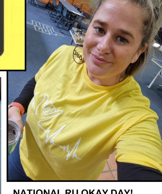
NATIONAL RU OKAY DAY!